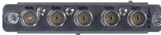
MD8000 – UVRX-J2K-2022 (SDI) – Electrical Rear Board Connectors