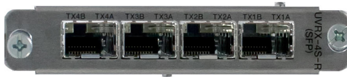
MD8000 – UVRX-J2K-2022 (SDI) – Optical Rear Board Connectors