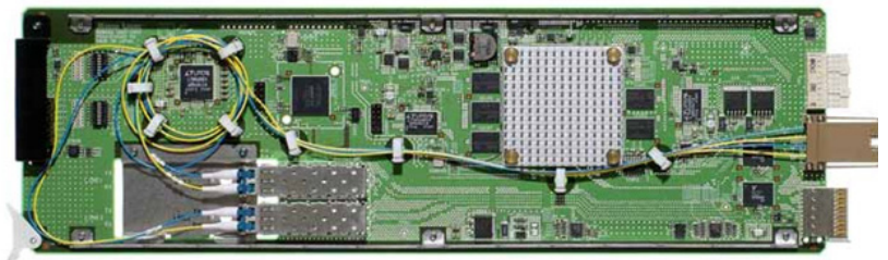
MD8000 - 2GbE – 2 Port 100/1000BT Trunk Module

The MD8000-2GbE module can be installed in any available slot in the 4-RU MD8000 chassis, the 7-RU MD8000EX chassis, or the 2-RU MD8000SX chassis. In combination with MD8000 signal interface cards and the flexible switch/controller units, many different types of media signals can be transported over common Ethernet network infrastructures. Full system configuration and alarm reporting is available through the extensive SNMP MIB and the Media Links Network Management System (NMS).